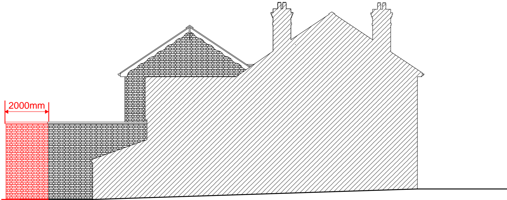
Proposed Left Side Elevation