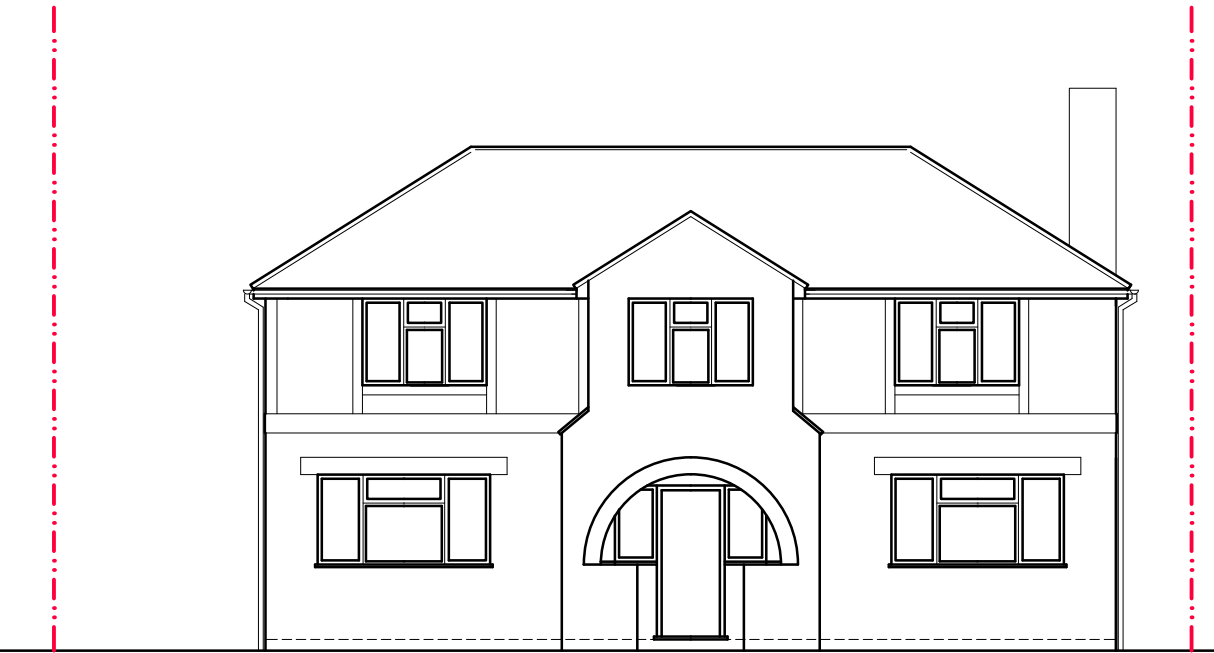
PRE-EXISTING FRONT ELEVATION