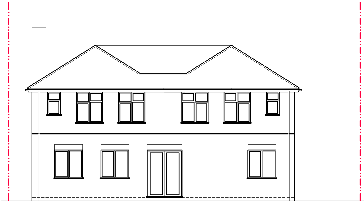
PRE-EXISTING REAR ELEVATION