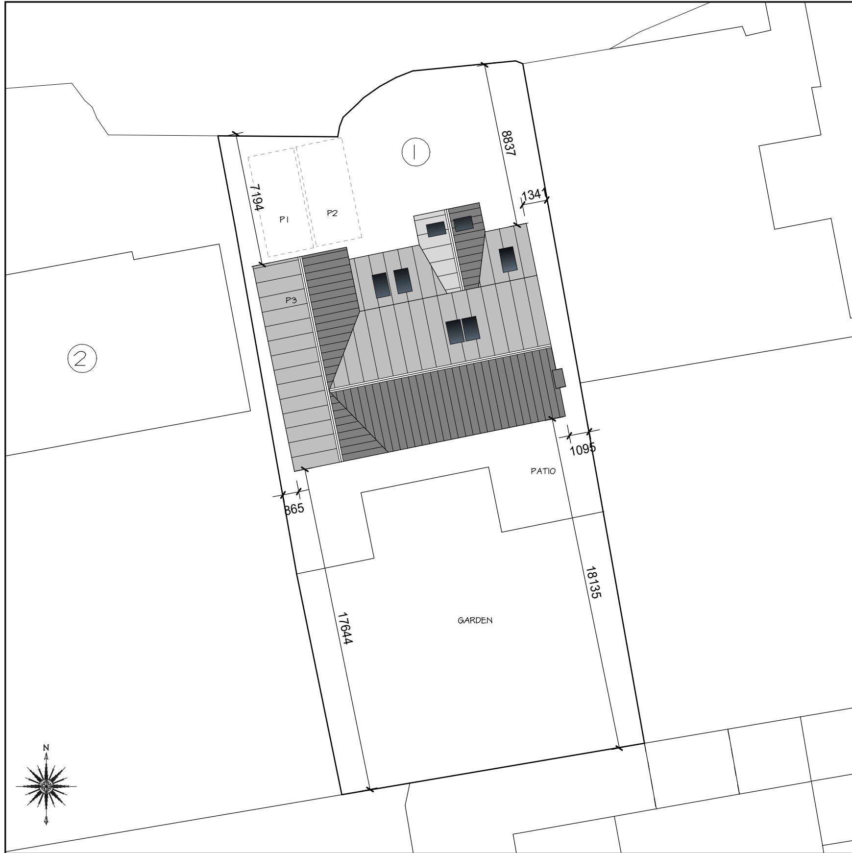
PROPOSED BLOCK PLAN 1:200