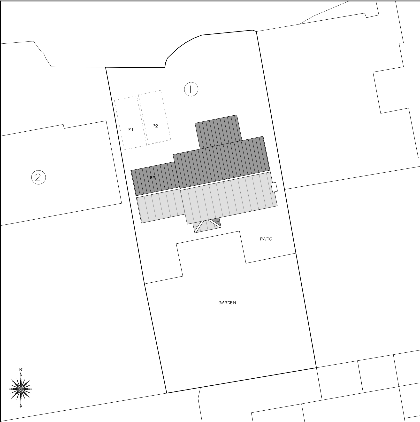
EXISTING BLOCK PLAN 1:200

Ivy Lodge, Twyford Road, Willington, Derby. DE65 6DE T/F 01283 703160 E info@makingplans-architecture.co.uk W www.makingplans-architecture.co.uk