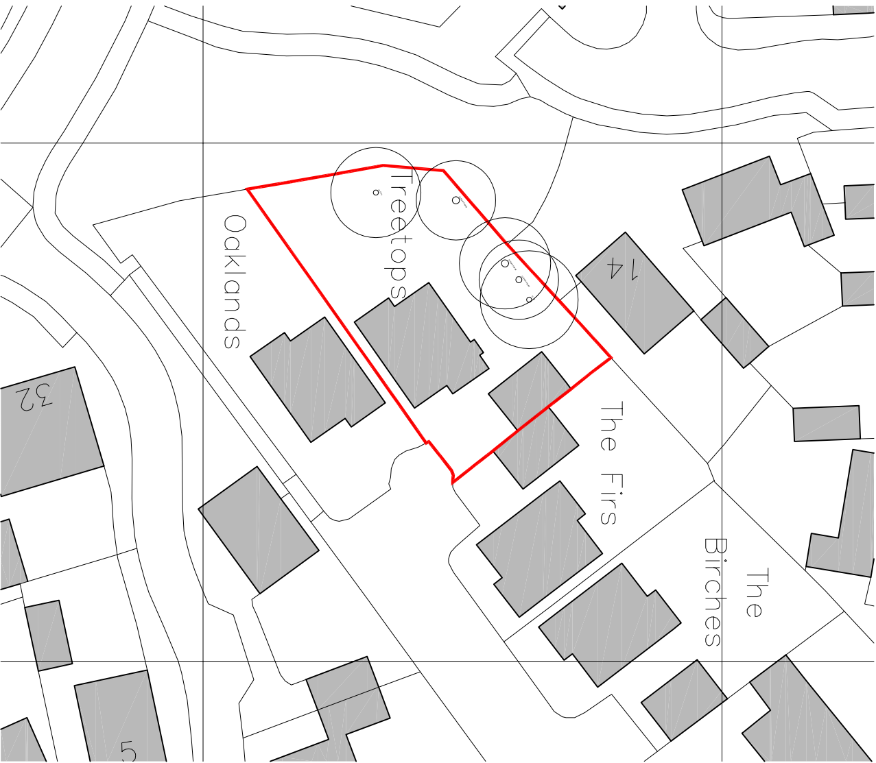
Block Plan - As Existing