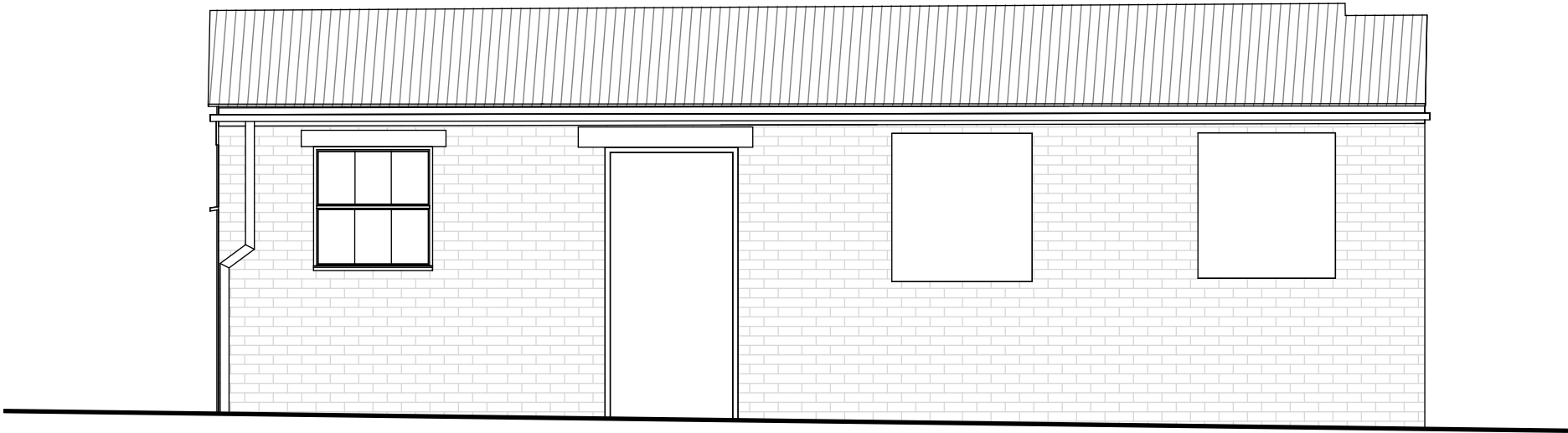
Existing Small Barn North Elevation 1 : 50

Figured dimensions only are to be taken from this drawing. All dimensions are to be checked on site before any work is put in hand.