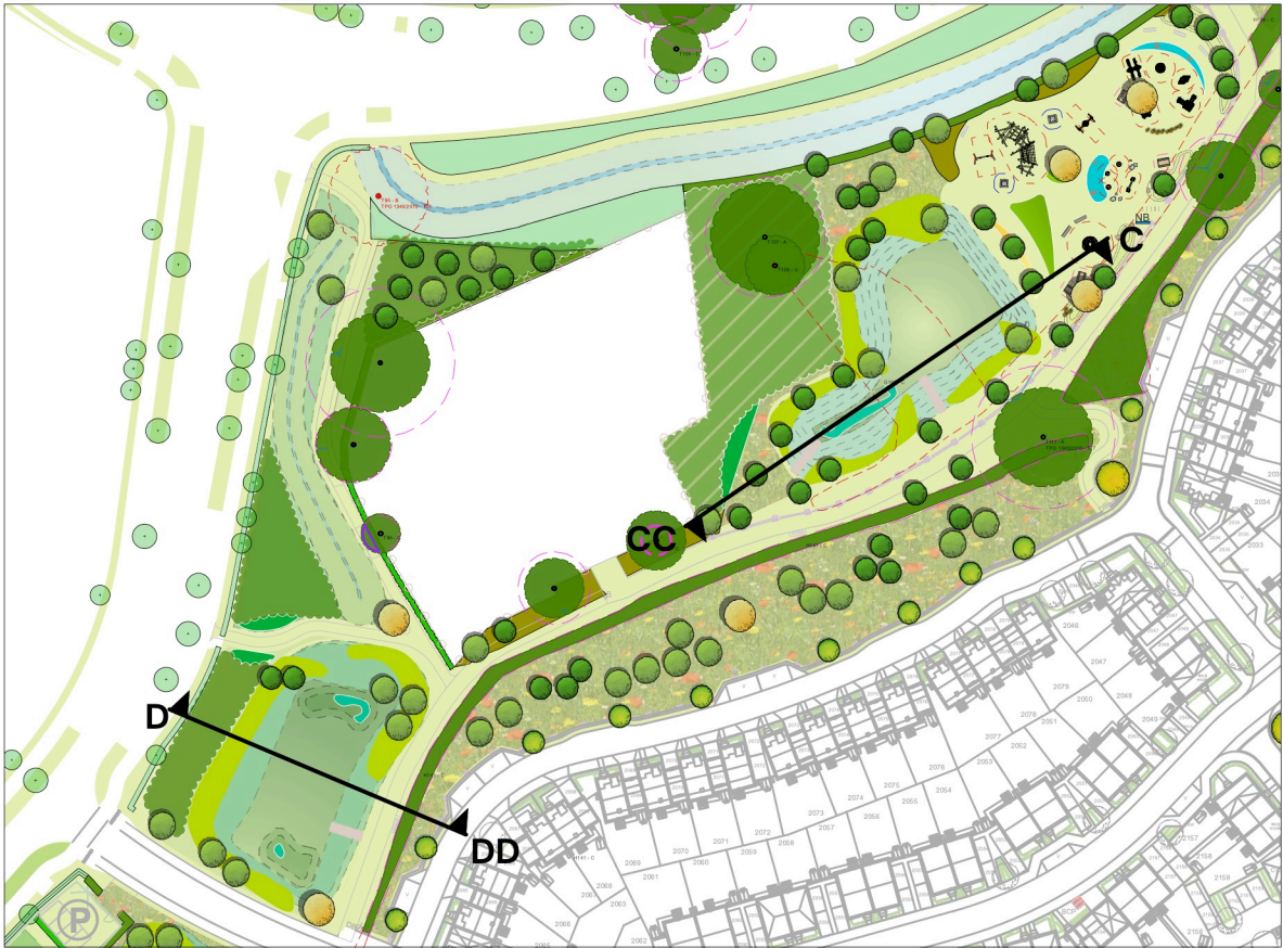
SITE LOCATION PLAN (NTS)