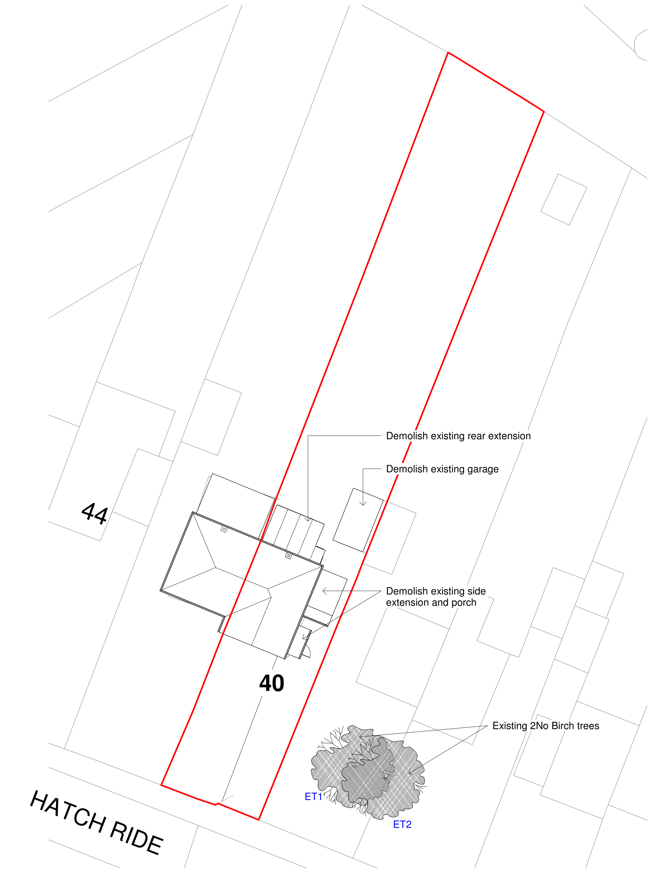
1 Site Plan - Existing 1 : 200