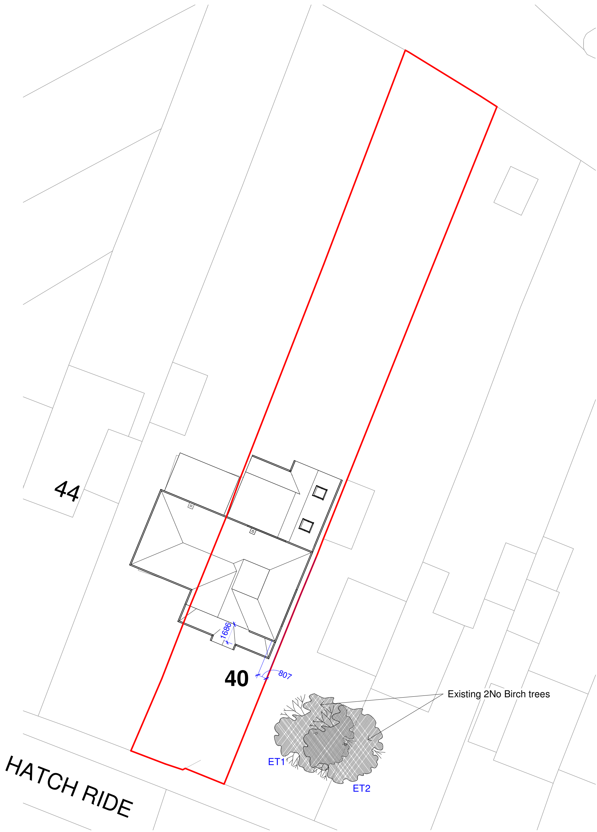
2 Site Plan - Proposed 1 : 200