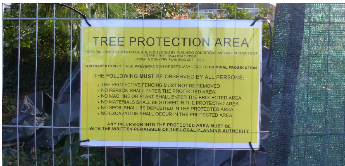
Fig 2. Signage attached to fencing reinforces the protection afforded by these barriers