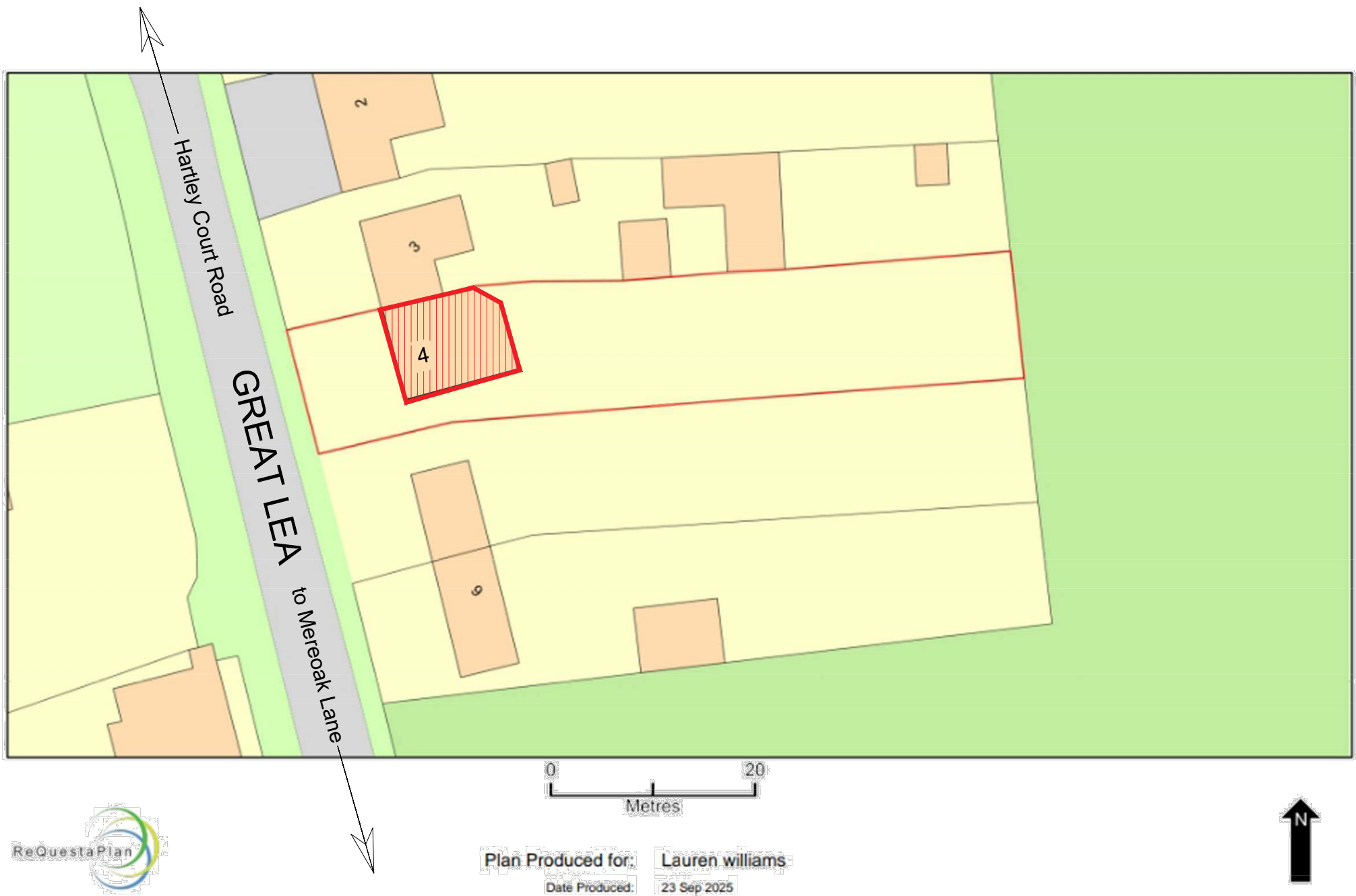
Block plan showing indicative development area 1:500@A3