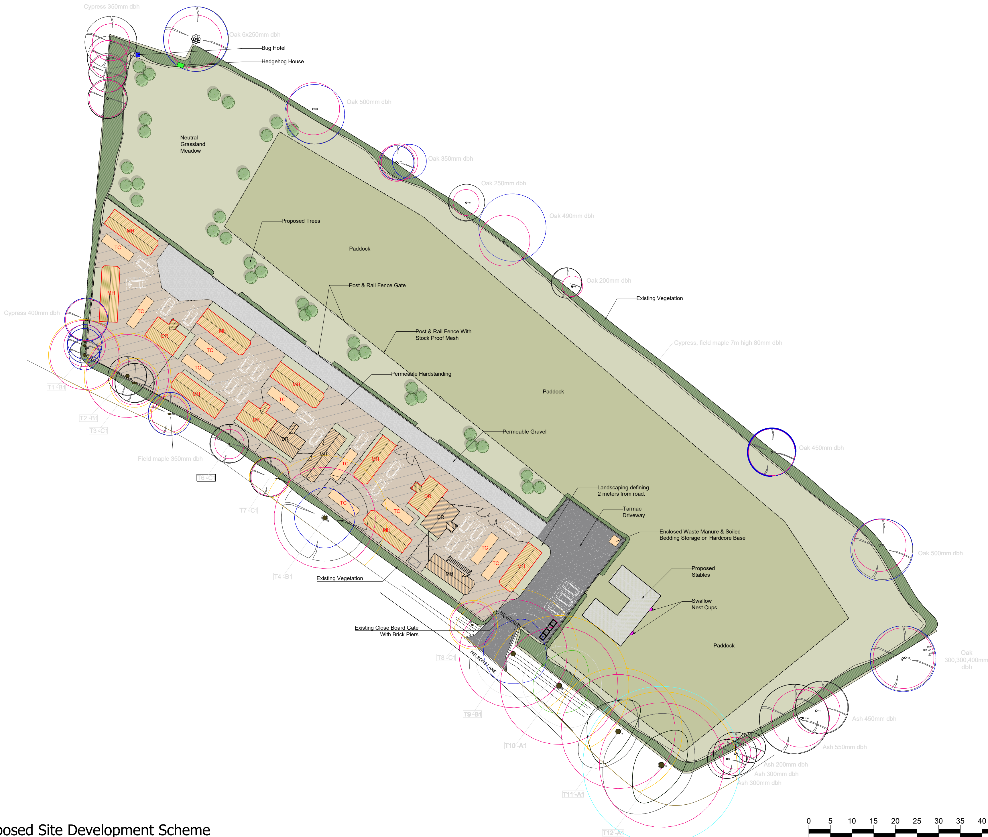
Proposed Site Development Scheme