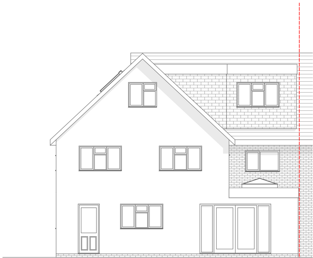
Proposed Rear Elevation 1:100