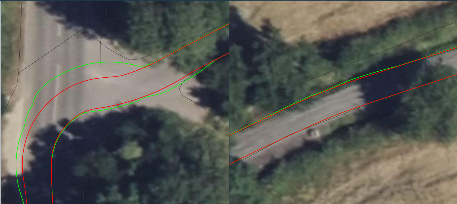
Vehicle Type NTS Detail Plan 1 0 5 10 Metres Scale 1:250 Detail Plan 2 0 5 10 Metres Scale 1:250

Liebherr LTM 1070-4.1 Mobile Crane Overall Length 12.520m Overall Width 2.820m Overall Body Height 3.900m Min Body Ground Clearance 0.410m Track Width 2.820m Lock to lock time 4.00s Kerb to Kerb Turning Radius 6.490m