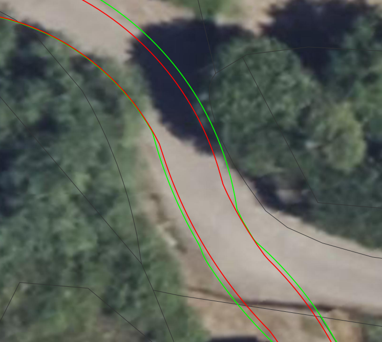
Detail Plan 4 Scale 1:250