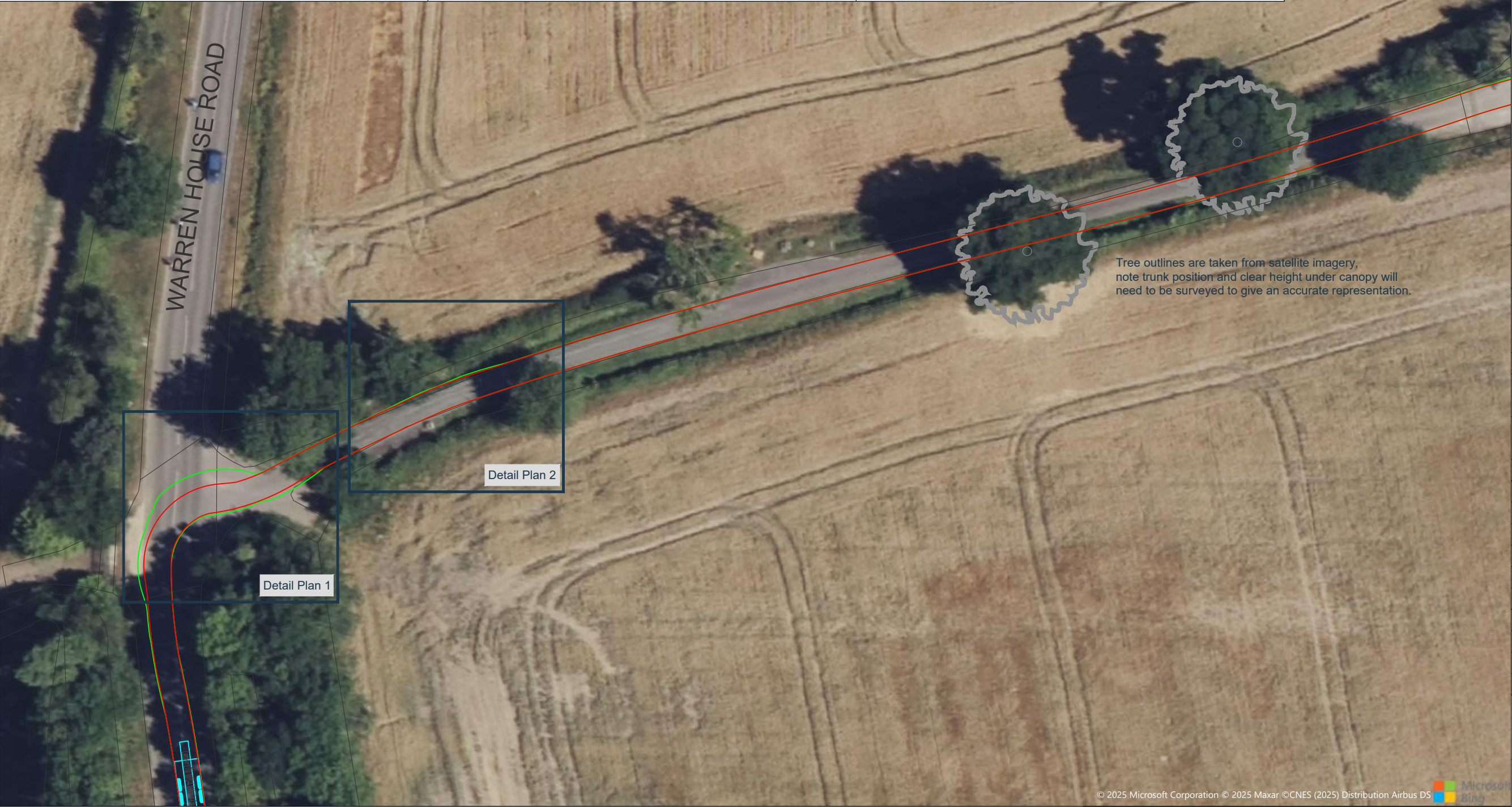
Site Plan 0 5 10 15 20 25 30 35 40 45 50 55 60 65 70 75 80 85 90 95 100 Metres Scale 1:500