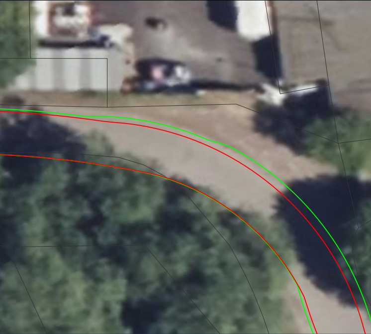
Detail Plan 3 Scale 1:250