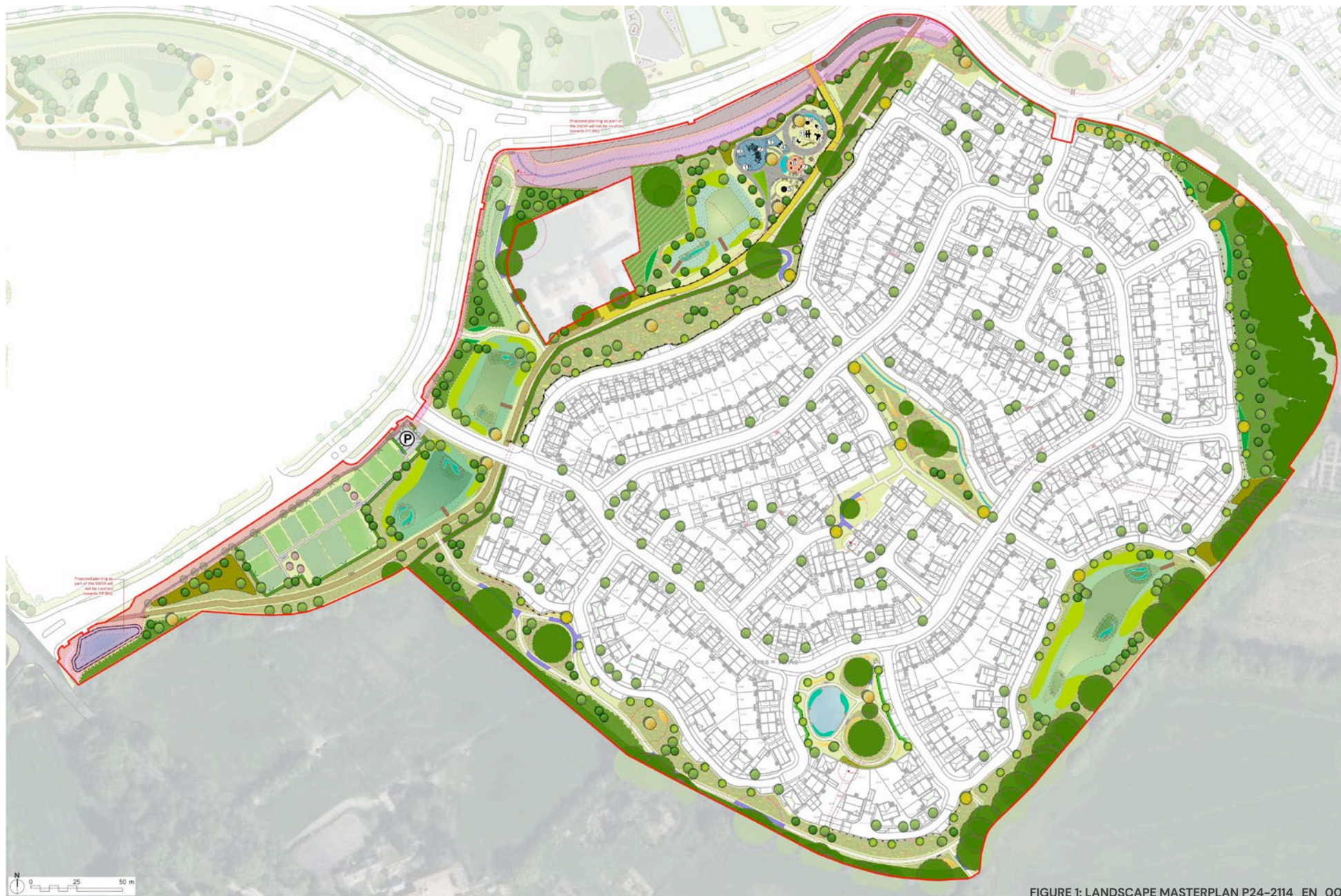
FIGURE 1: LANDSCAPE MASTERPLAN P24-2114_EN_001