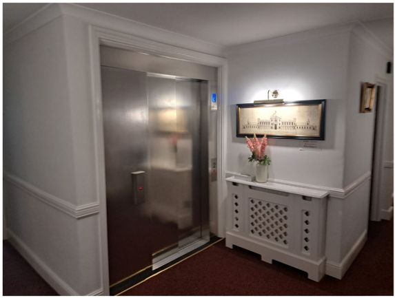
New fire shutter/ curtain linked to fire alarm system to front of lift to manufacturers specification