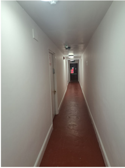
New door to existing corridor to reduce distance between compartmentation