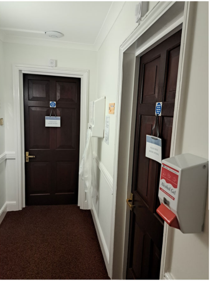
Typical Second floor doors for upgrade