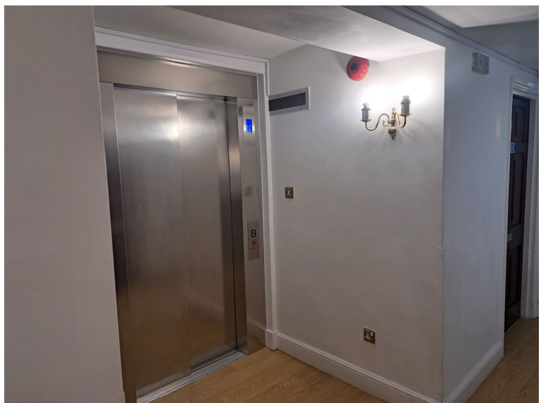
New fire shutter/curtain linked to fire alarm system to front of lift to manufacturers specification

* Please note that the design plans and proposals produced are based upon a Fire Risk Assessment 24.08.2025 by Nadim Choudhary of Fire Safety Services Ltd IFE Membership no. 00071097. These drawings are for Listed Building Application Purposes only and any variation to the designed scheme should be approved by the appointed Fire Consultant.