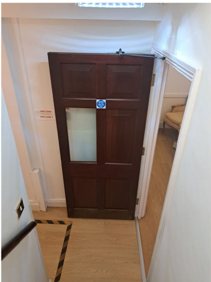
Image of typical Basement door to be replaced